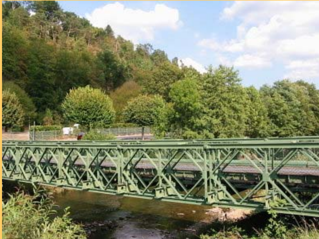
Bailey Bridge over Meurthe River, France